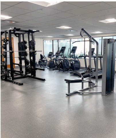
Fitness Facility (Building B)

Minutes from Davies Transit Centre and future LRT station