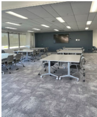
Tenant Lounge (Building B)