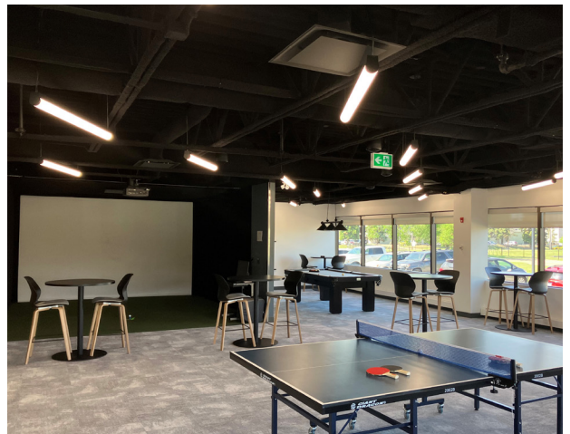
Tenant Lounge (Building B)